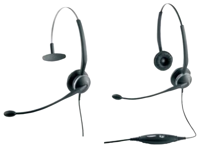
Jabra GN2100 IP

The Jabra GN2100 Series is also available in a variant for use with conventional desk telephones.